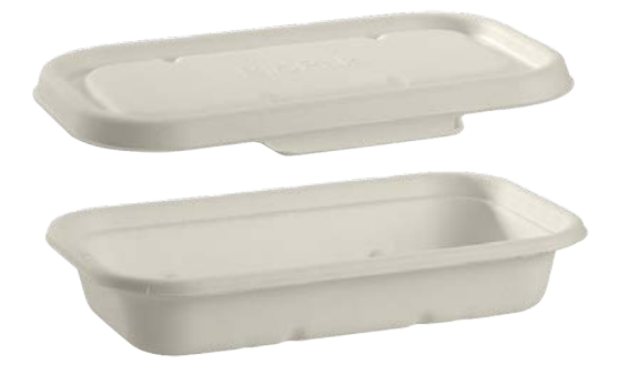
BioPak 750 ml cane base & lid

For food that is not wet, cardboard is an option. There are also cardboard containers with bioplastic lining available, which will allow for wet food (even hot food). The lining is not home compostable - so for wet food we prefer to avoid the lining and stick with bagasse.